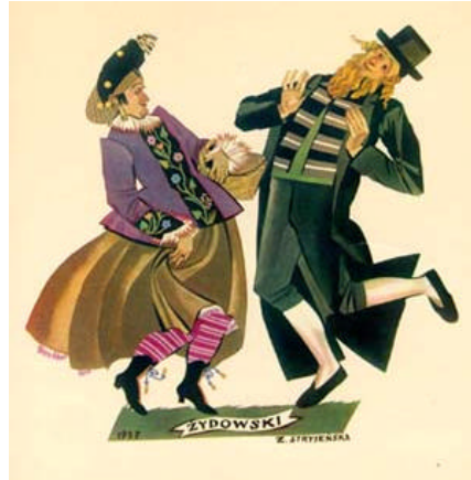
Dancing Jews by Zofia Stryjenska (1929)

An essential part of the wedding feast was the ritual, in which honored guests, the fathers-in-law, elder relatives, rabbi, etc. danced to slow elaborate tunes. The two mothers-in-law mimed their mutually feelings in the broygez tants ("dance of anger") and in the sholem tants