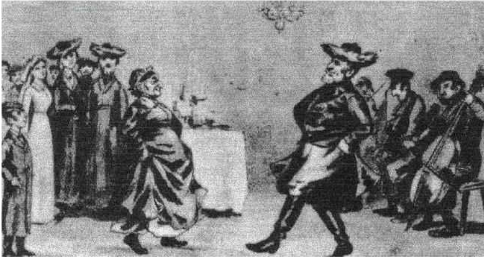
Mekhutonim tants (in- laws dance) Galicia, late 19 th century (anonymous artist)

The choreographic system that emerged seems to have been fairly stable over most of the area of Jewish settlement in Eastern Europe from earlier to mid-19 th century only until the end of the 20 th century. By then modernization and Enlightenment, and in some places (parts of Hungary, Moldavia and Wallachia) cultural assimilation, weakened the practice of the system. The First World War and the Russian Revolution marked the end of this choreographic system as the dominant one. After the Holocaust traditional Ashkenazic dance was still practiced among some Yiddish-speaking communities in the former Soviet Union and among members of the landsmanshaft culture in the United States, especially in New York and Philadelphia.